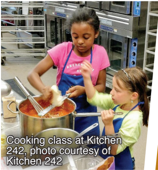
Cooking class at Kitchen 242