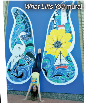
What Lifts You mural