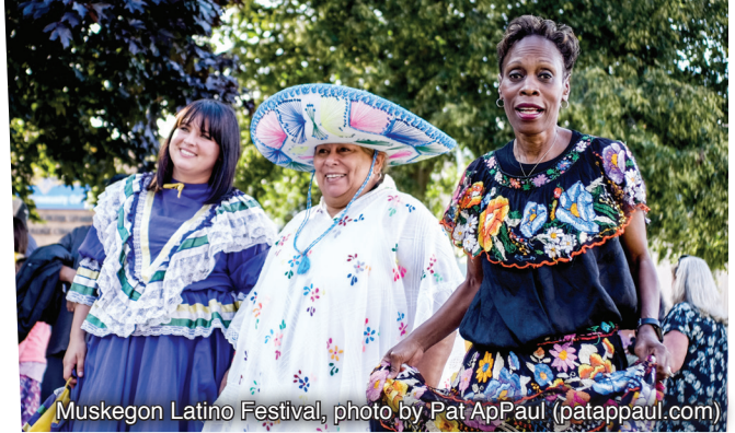
Muskegon Latino Festival