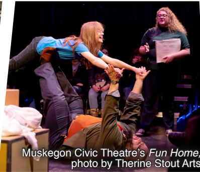
Muskegon Civic Theatre's Fun Home