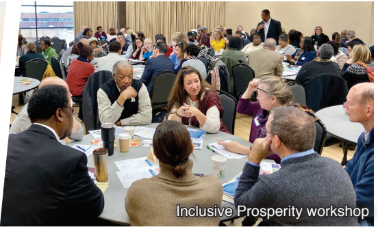
Inclusive Prosperity workshop