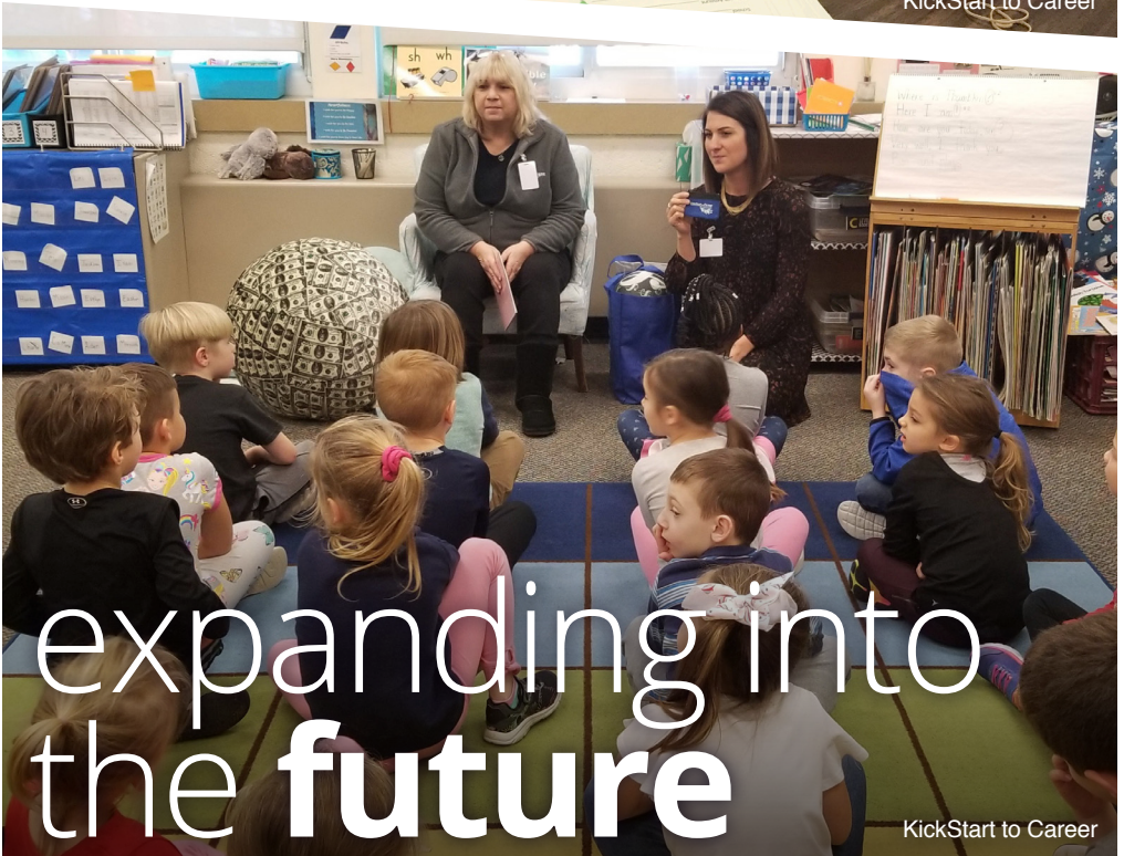
KickStart to Career