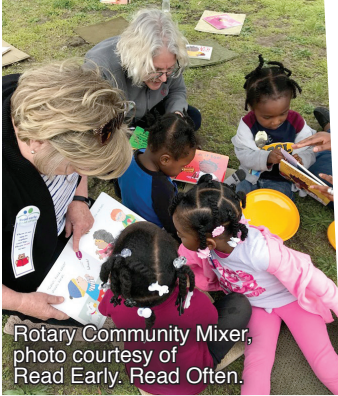
Rotary Community Mixer