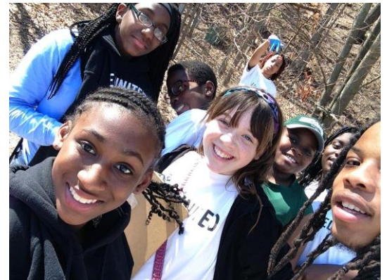
Boys and Girls Club of the Muskegon Lakeshore

Building a welcoming, accepting community that respects difference and actively promotes full participation by all people; a place where everyone has the opportunity to share their voice, to participate in decisions that affect their lives, and access all the community has to offer.