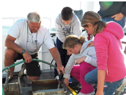
Annis Water Resources Institute