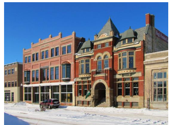
Russell Block Downtown Muskegon