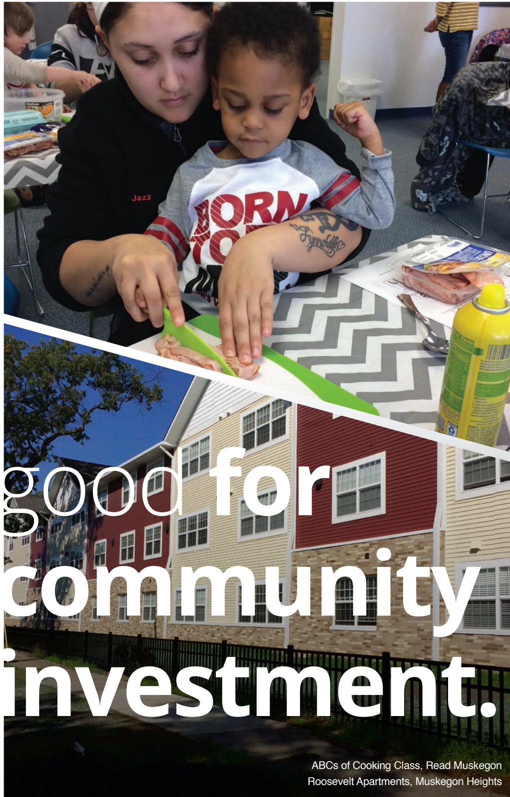
ABCs of Cooking Class, Read Muskegon Roosevelt Apartments, Muskegon Heights