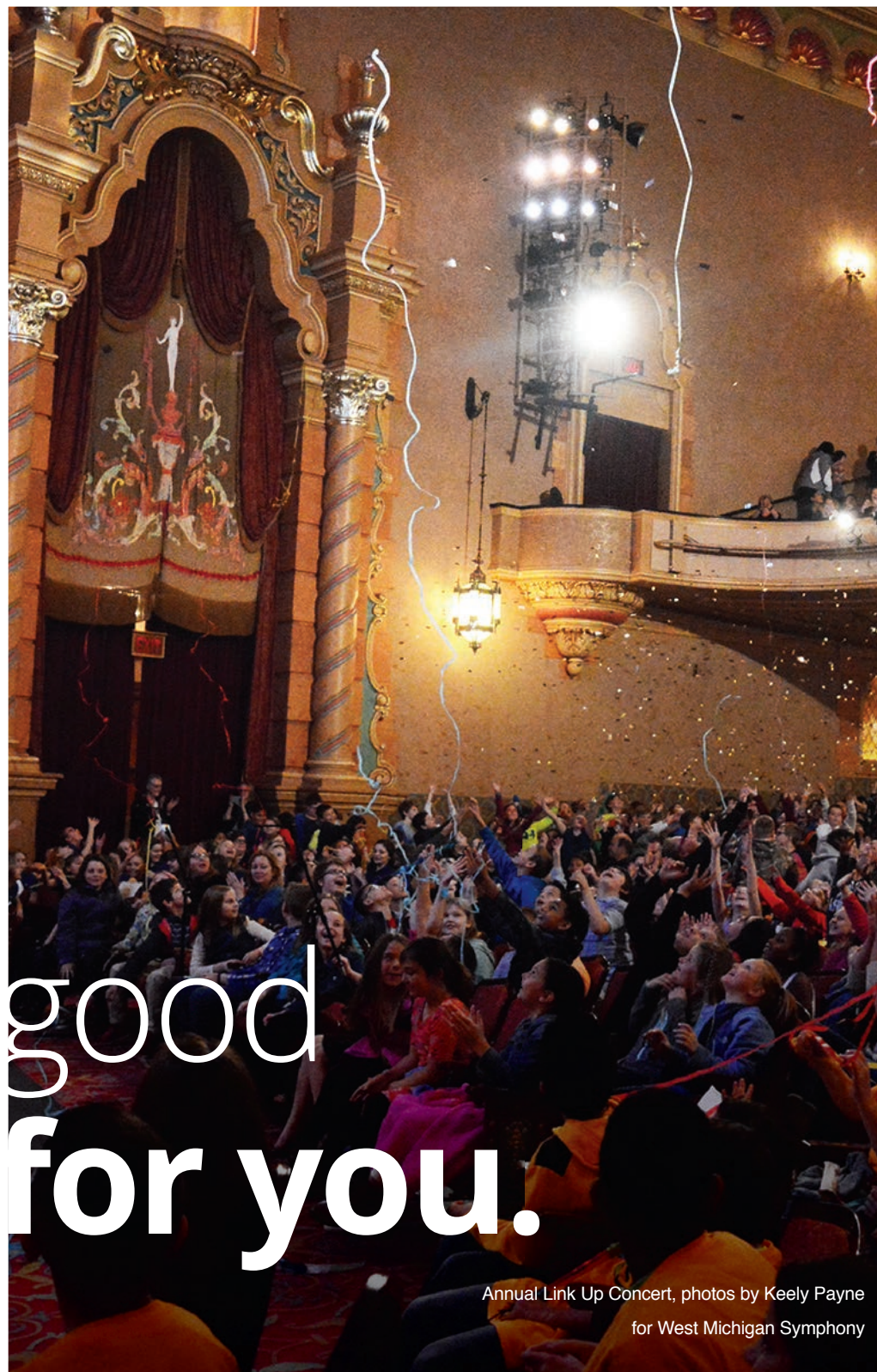
Annual Link Up Concert

Great things continue to happen in Muskegon County! Everywhere we look, we see new community investment, growing educational opportunities, cultural renewal, youth and family engagement, healthier lifestyles, and so much more – all because of you! The work you support is making lasting, positive change in our community and we're proud to be your partners.