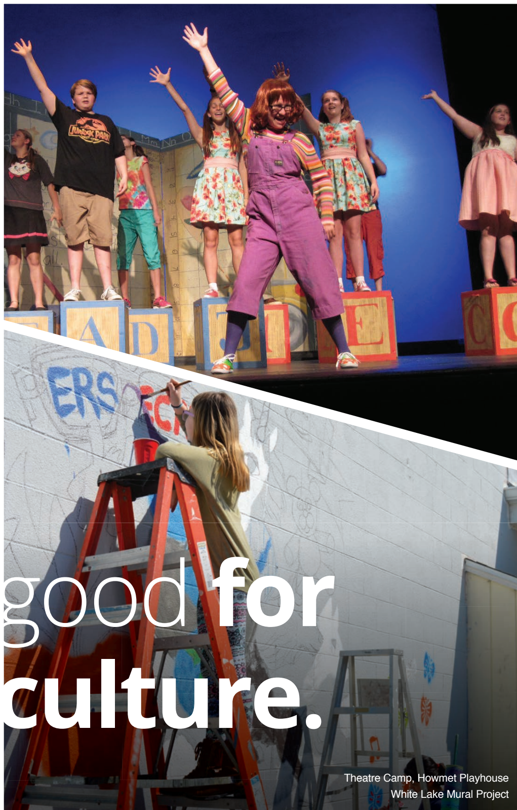
Theatre Camp, Howmet Playhouse White Lake Mural Project

It's a wrap. Three years of planning and effort by the Howmet Playhouse nudged their capital campaign past its original goal to $3.7 million! Renovations “for the next 100 years” should be complete soon, ensuring that this well-loved 1916 theater remains a favorite gathering place. Gifts came from near and far: local community members gave generously, and summer residents chipped in from wherever they call home. Many people gave appreciated stock, while others directed their IRA Required Minimum Distributions right into the Campaign Fund. Both continue to be tax-smart strategies to support the projects you love!